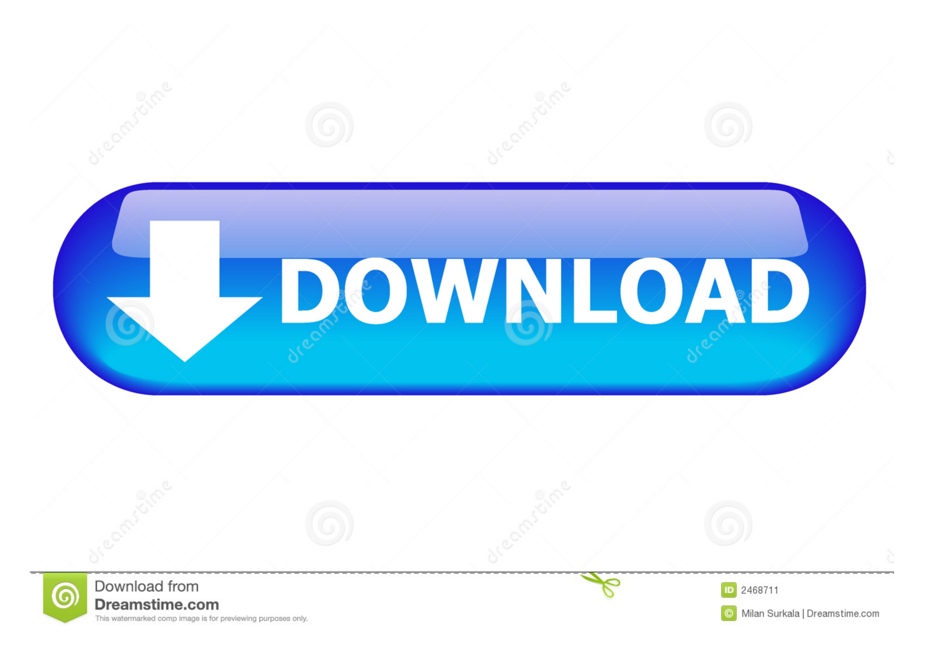
Evp And Crack.rar